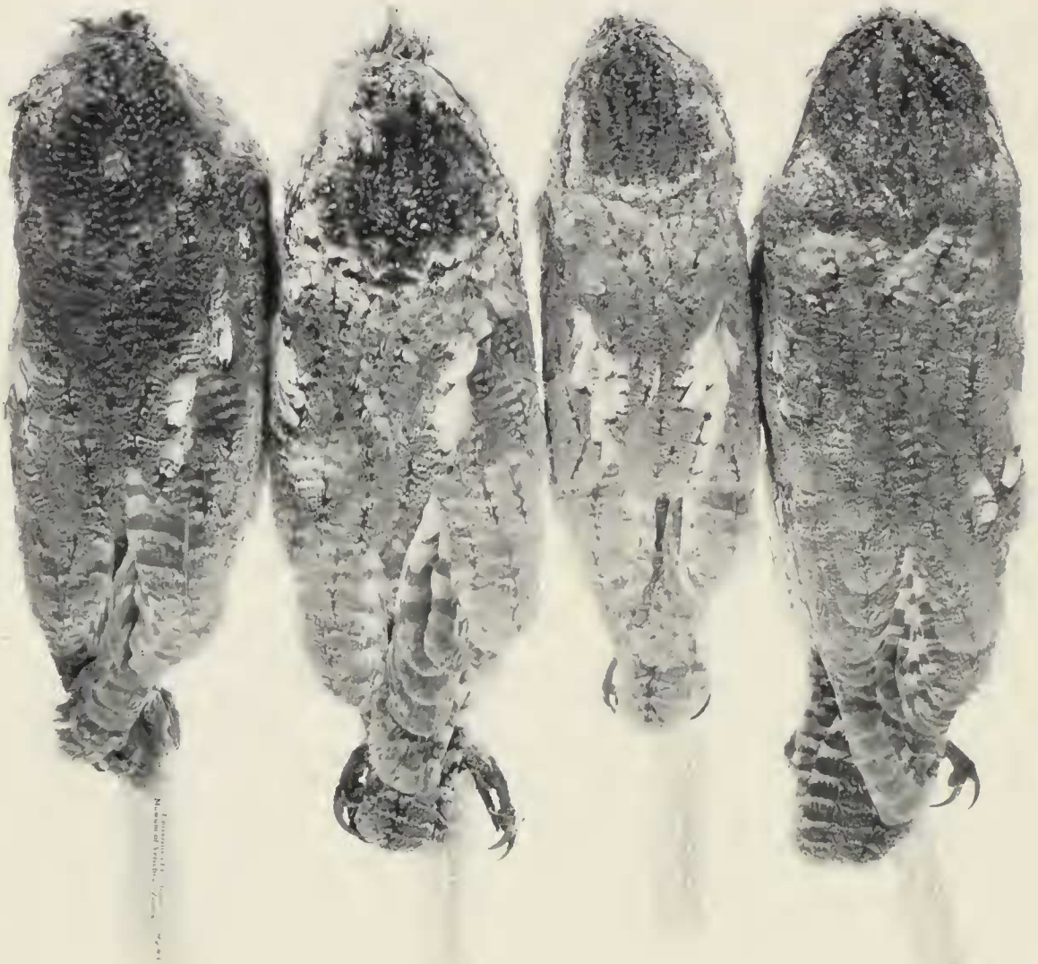
FIG. 2. Photographs of male specimens of Otus in dorsal (left) and ventral (right) aspect. From left to right: O. guatemalae guatemalae (MVZ 142430, Guatemala); O. roboratus roboratus (MVZ 160801, Dept. Amazonas, Perú); O. roboratus pacificus (MVZ

lished incorrectly as 023.13.1564 by Hekstra [1982:58]), British Museum (Natural History), Tring, collected August 27, 1899, by P. O. Simons (not examined).